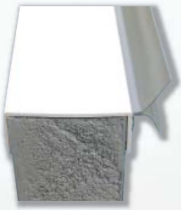
Dual durometer top seal for good thermal performance.