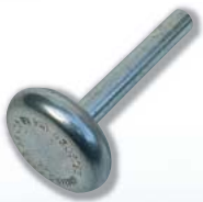
Large 50mm diameter steel roller for extra strength and long life.