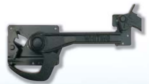
77 lock complete with keeper

A variety of lock systems are available.