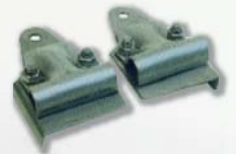
Stainless steel end hinge and roller carrier. Removable cap allows roller change without removing panels.